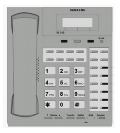
DS 24 telephones do not have an ANS/RLS key but can be programmed using a feature key.

The ANS/RLS key can be used to answer a ringing call or hang up.